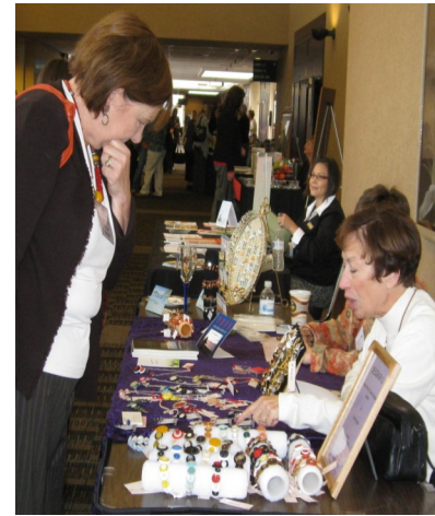
Fall Conference Vendor Fair

Thank you so much to those of you who continue to step up to help with presentations, provide auction items and constructive criticism and suggest great presenters. Please contact officers of either organization with any good ideas you have for this coming fall.