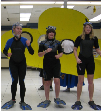
Entertainment at the WAFCS Dinner and Variety Show at Fall Conference Selah High School FCCLA students performed Yellow Submarine Skit