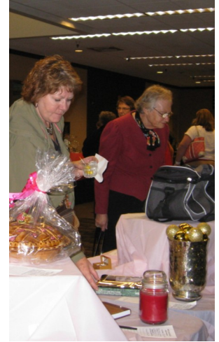
WAFCS Silent Auction Fall Conference