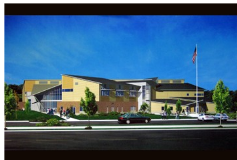
South Lake High School 8601 Rainier Ave S Seattle WA 98118

Also, I would love any recommendations as to how we can make our organization the best one ever!!